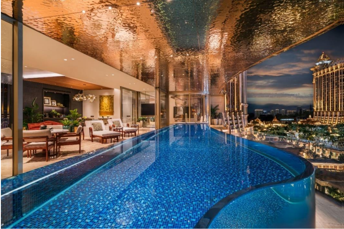
Capella at Galaxy Macau