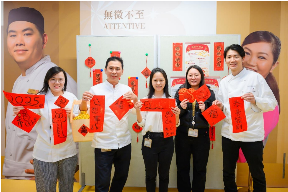
P006: GEG's Human Resources and Administration Department arranged a variety of Chinese New Year-themed activities for its team members to immerse in the festive atmosphere.