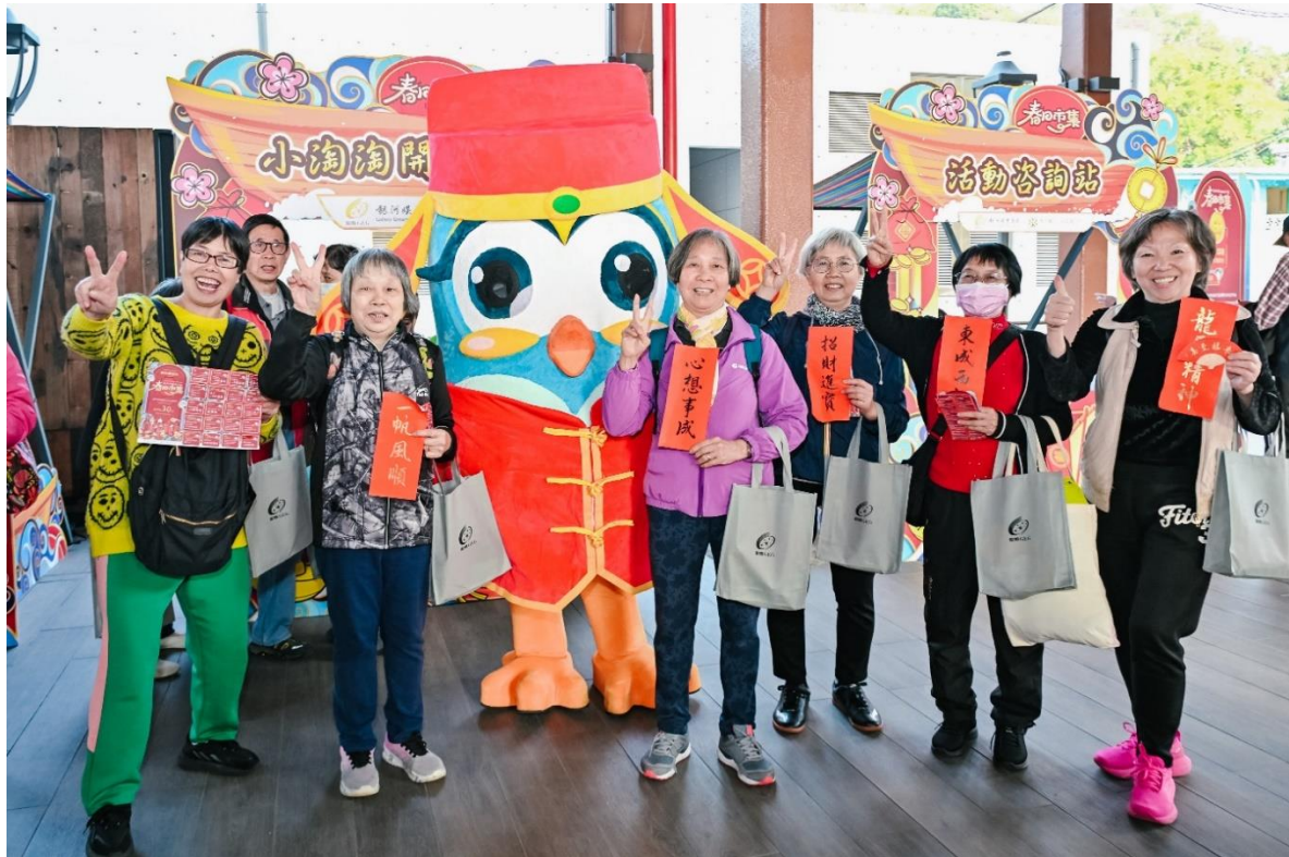
P004: On the opening day of the Spring Market, GEG invited members from the Macau Deaf Association, the Macau Special Olympics, and the Areia Preta Community Service Centre of UGAMM to partake in the festivities.