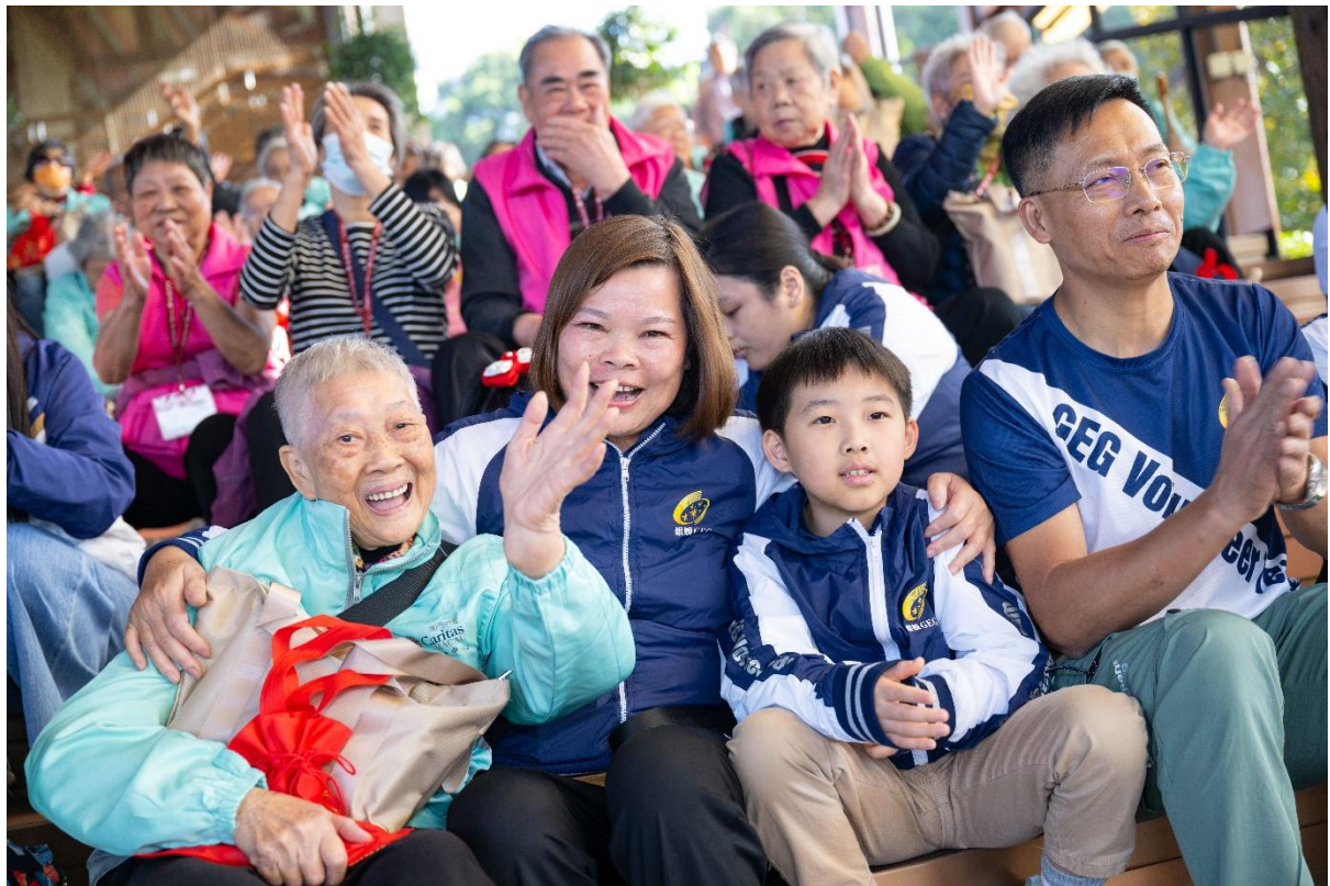
P003: Accompanied by GEG Volunteers and their family members, the elderly explored the Spring Market.