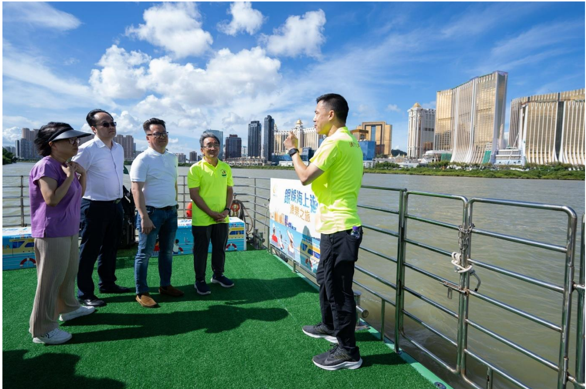
P002: Representative of the Fishermen's Mutual Help Association of Macau took the guests and participants on the ship deck to enjoy the urban and coastal scenery of Macau.